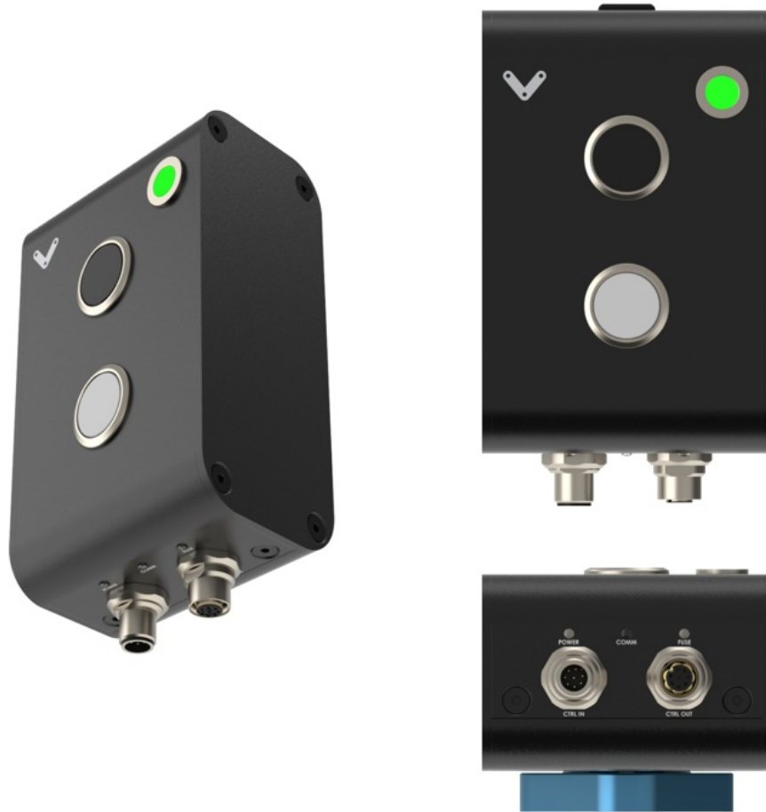
Figure 1: Physical interface