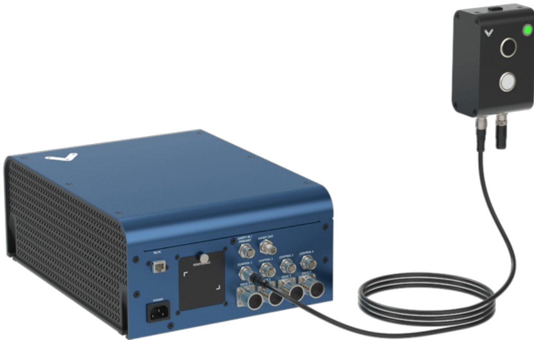
Figure 2: Momentary Pushbutton module with MachineMotion V2