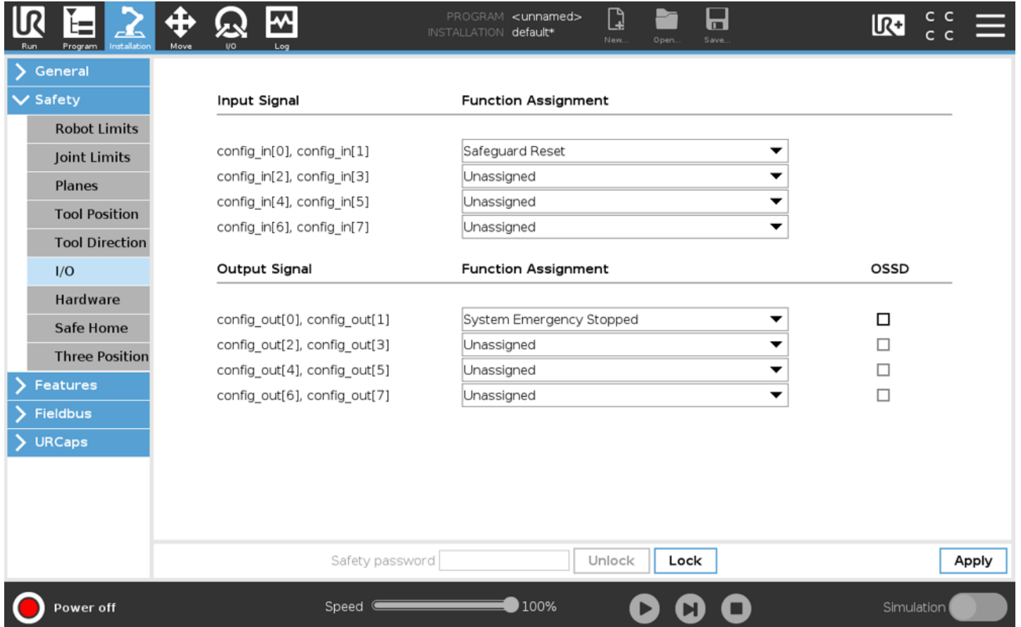
Figure 3: UR Teach Pendant configuration

Set config_out[0], config_out[1] to "System Emergency Stop", as seen in the figure below