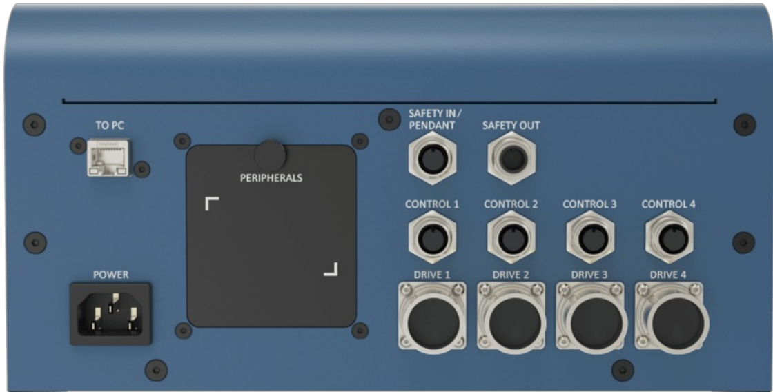
Figure 1: MachineMotion V2 controller

The following table describes the functionality of each component