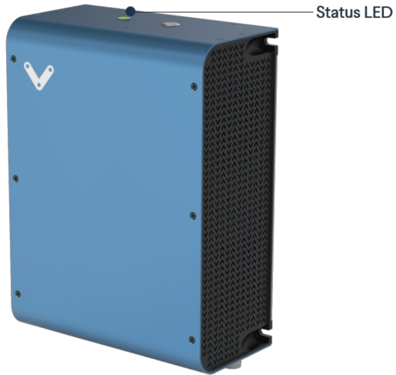
Figure 2: MachineMotion status LED

To understand the status LED, please see table below: