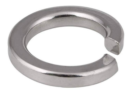
Vention First Release

The split washer works in two ways: first, its spring shape helps maintain the fastener's preload. Second, the sharp edge of the split washer digs into the parent material to prevent the fastener from unscrewing.